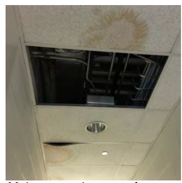
Maintenance issues at the current laboratory

$65.5 million is included in Rebuild Illinois for the land acquisition and planning of a new Illinois State Police combined crime laboratory and administrative facility. The current Joliet Forensic Science Laboratory, built in 1964, is responsible for work products that directly affect the criminal justice system and services over 200 law enforcement agencies. The current facility was neither designed for nor can adequately support the technology necessary in the modern forensic science environment. Frequent incidents such as power outages, HVAC issues and the re-tasking of analytical staff to deal with these issues has also unquestionably impacted the volume of case analysis the laboratory can produce. A significant amount of analytical time is lost when these systems repeatedly fail. A