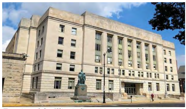
Exterior of the Illinois State Armory Building in downtown Springfield.

$55 million for a new combined Illinois State Police facility in the Metro-East to accommodate various divisions at the ISP, including SWAT forces. The new facility will provide adequate storage for specialty equipment. This new facility should include a new firing range and training room which are critical to maintaining standards and improving safety outcomes in high risk situations. Construction of this new facility will allow the ISP to combine several work locations, reducing yearly repair and maintenance costs and eliminating the need to lease specialty space for SWAT.