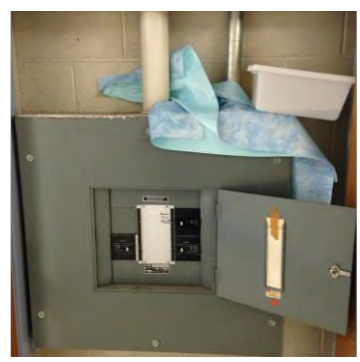
Frequent leaks threaten the electrical system at the current laboratory.

$126 million for the Department of Public Health for a new Cook County Public Health Laboratory. The Illinois Department of Public Health laboratories are the backbone of many public health functions and are designed to provide unique and essential testing and surveillance. The Chicago facility is the state's largest. It has deteriorated over the past four decades, jeopardizing the state's ability to respond to public health issues. Funding will allow CDB to construct a new, state-of-the-art facility that meets federal biosafety requirements. This ensures CDB can continue to secure federal funds and will allow for efficient and effective laboratory operations.