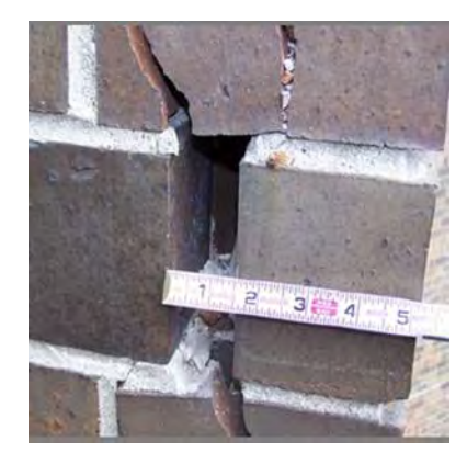
Deferred maintenance projects at public universities.