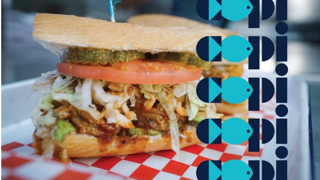
Copi Po' Boy prepared by chef Brian Jupiter

Consumers can purchase Copi at the following locations: