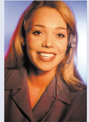
A SHIP counselor is waiting for your call today.

Call us and let our counselors assist you with your health insurance questions.