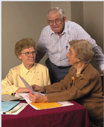
SHIP volunteer counselors provide you with information you need to make educated decisions about your insurance.

SHIP trains volunteer counselors throughout the State of Illinois to provide one-on-one help with your insurance.