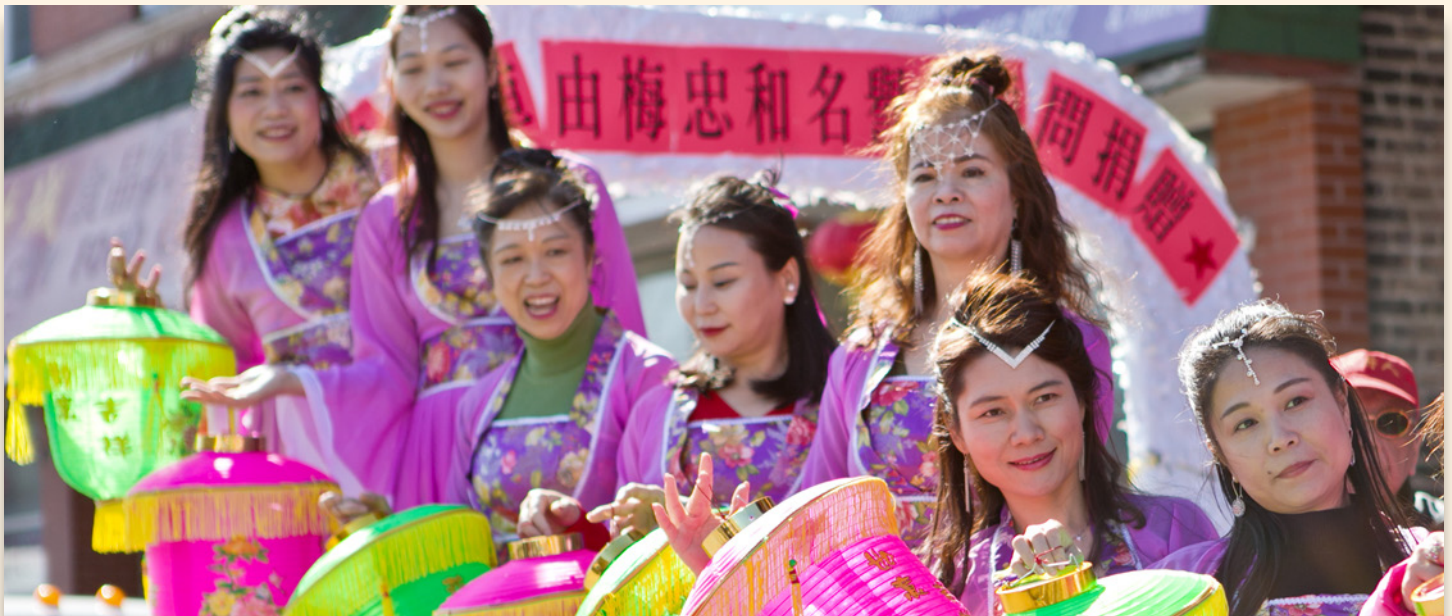
Archive: The Chinese Lunar New Year Parade in Chicago