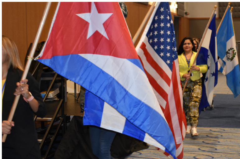
Parade of Flags, 2019