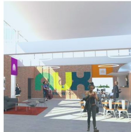
Digital Rendering of The Aux

or call us at 312-868-0040 Ext. 203, or Ext. 247 (for Spanish)