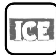
Ice: Giant City Lodge