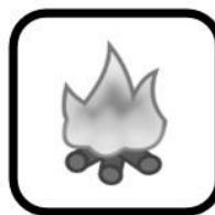
Firewood: Giant City Stables