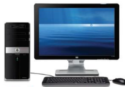
On-line licenses for Fishing & Hunting

The Illinois State Museum in Springfield invites visitors to a new exhibition that highlights a major gift of more than 100 contemporary artworks given to the museum in 2016 by Chicago collector and arts advocate Chuck Thurow. "Just Good Art: The Chuck Thurow Gift" exhibition will be on display at the Illinois State Museum from February 4 through May 7. For more information click here