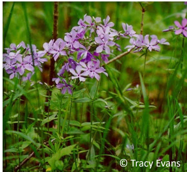
plants with flowers