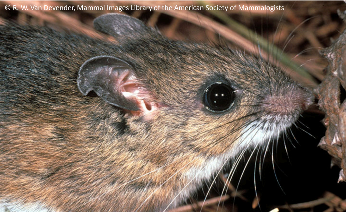
© Illinois Department of Natural Resources. 2021. Biodiversity of Illinois . Unless otherwise noted, photos and images © Illinois Department of Natural Resources.