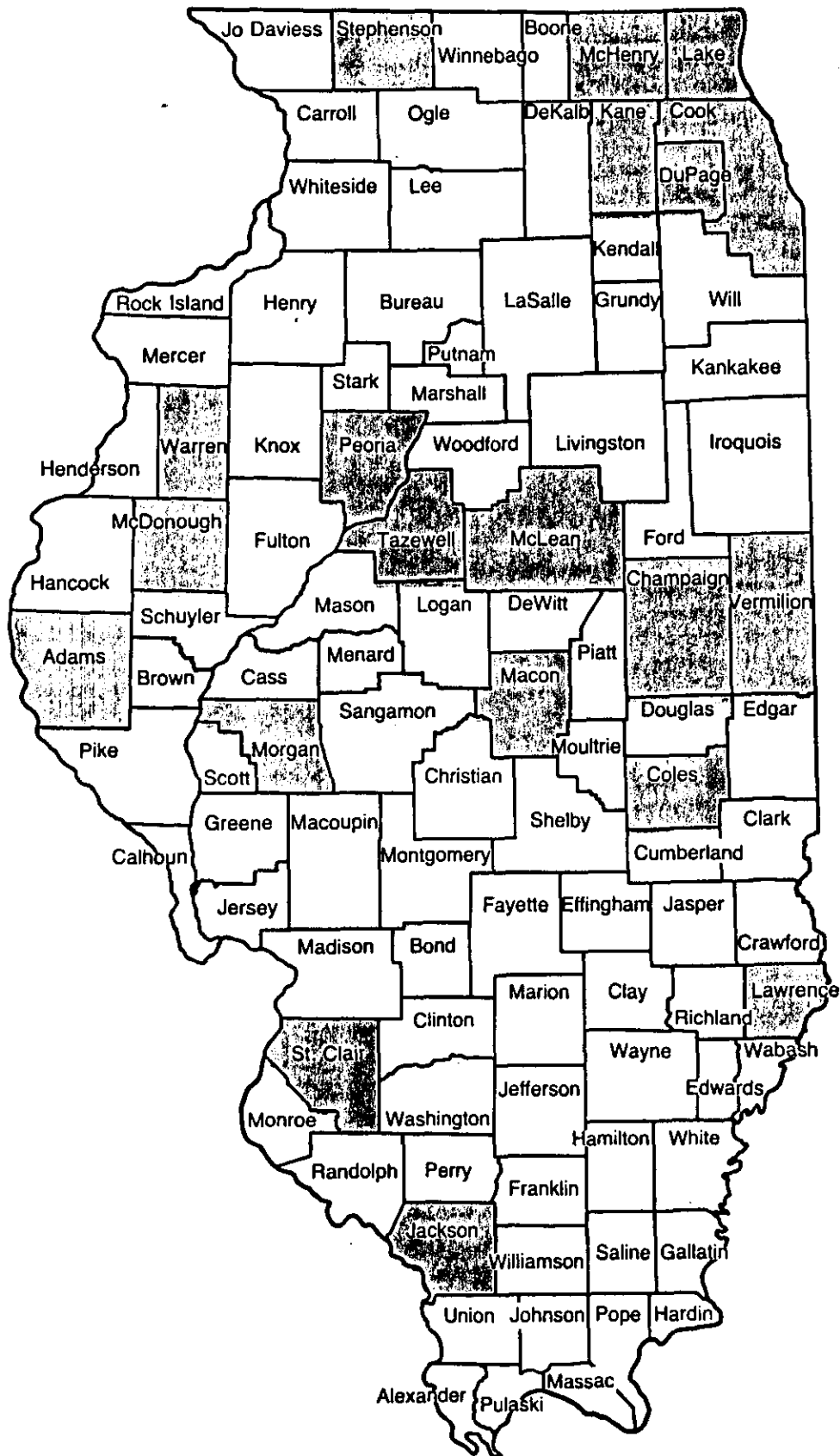
Figure 1. Counties surveyed as part of the 1986 Illinois Breeding Bird Atlas.