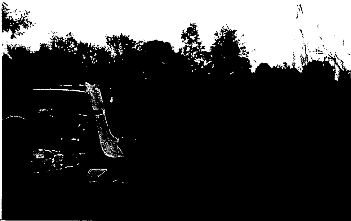
Figure 1 Equipment for nocturnal survey at "Remote Prairie", Siloam Springs State Park, Adams County, Illinois.