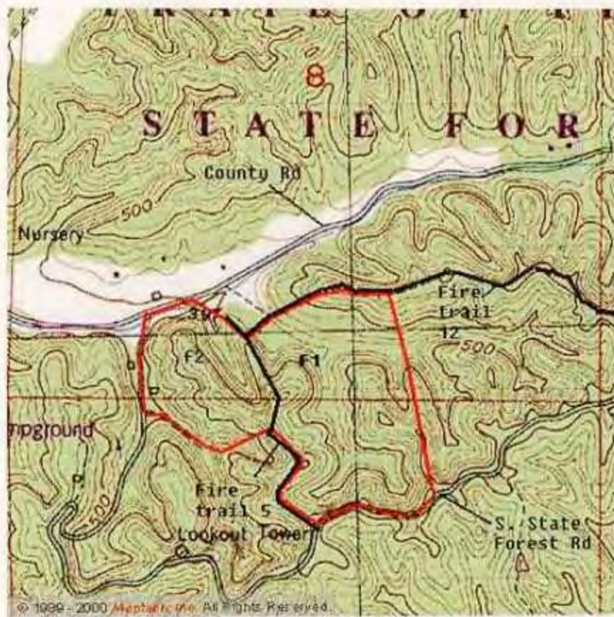
Figure 1: Burn Unit Map Trail of Tears State Forest/Ozark Hills Burn Unit TTSE f1 and f2