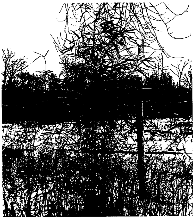
Photo 5. Cane plant with lateral shoots at Shellbark Bottoms Natural Heritage Landmark, Lawrence County, Illinois. Date of photo: January 3, 2003.