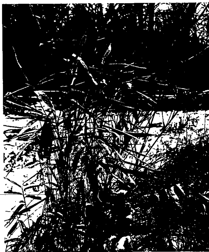
Photo 6. Cane plant at Shellbark Bottoms Natural Heritage Landmark, Lawrence County, Illinois. Date of photo: January 3, 2003.