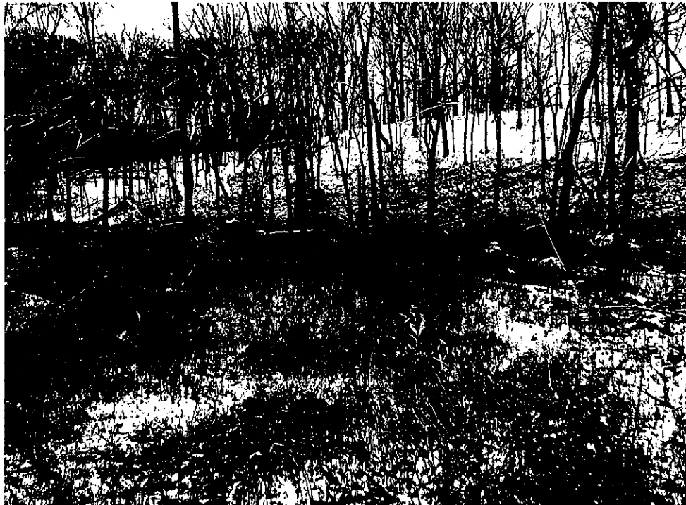
Photo 1. Photo of cane cluster at Shellbark Bottoms Natural Heritage Landmark, Lawrence County, Illinois. Date of photo: January 3, 2003.