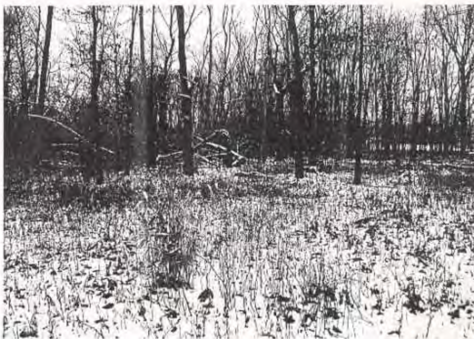
Photo 4. Cane plant at Shellbark Bottoms Natural Heritage Landmark. Date of photo: January 3, 2003.