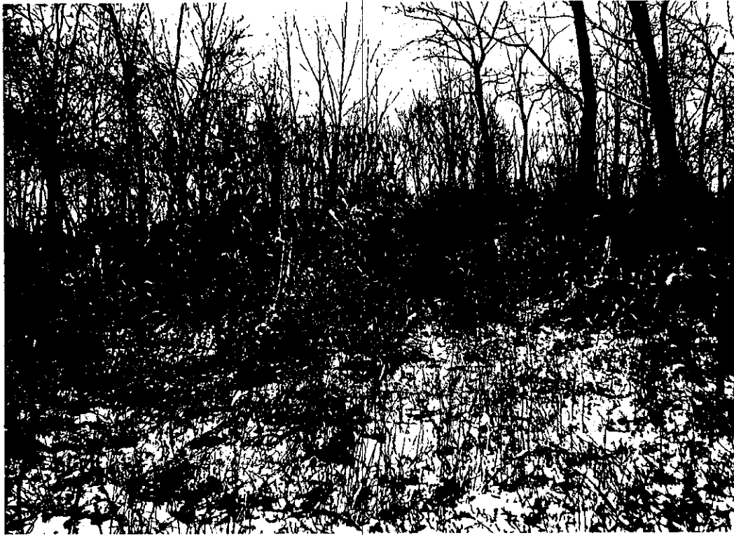
Photo 3. Cane plants at Shellbark Bottoms Natural Heritage Landmark. Date of photo: January 3, 2003