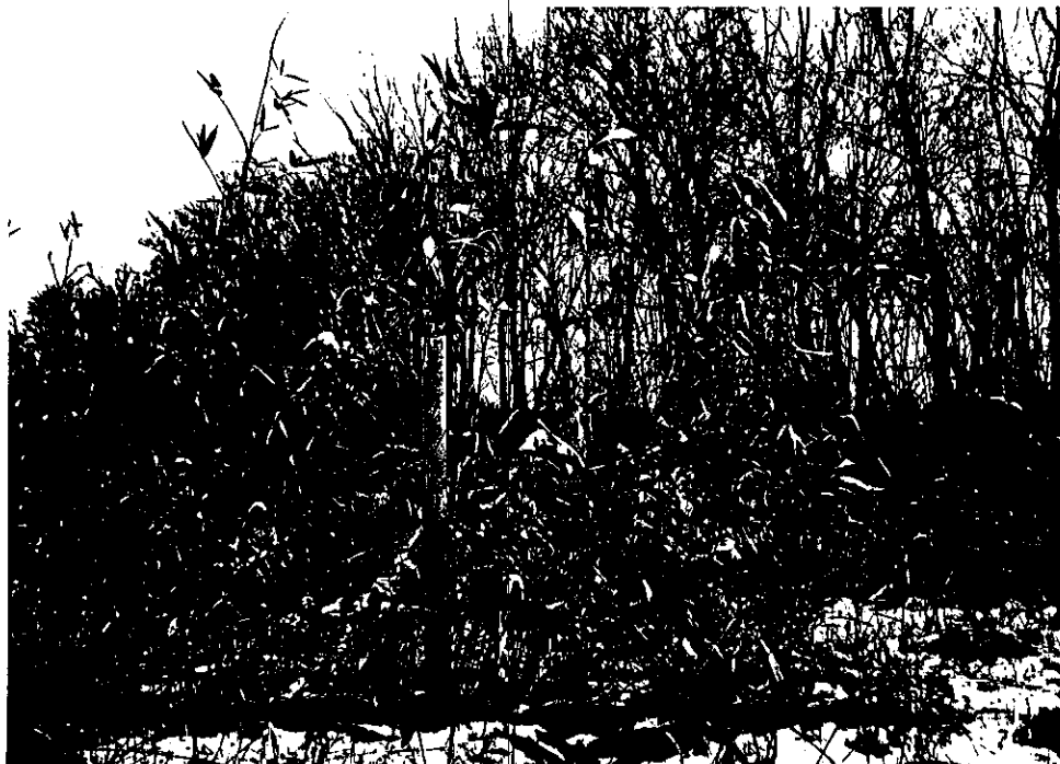
Photo 2. Photo of cane plants at Shellbark Bottoms Natural Heritage Landmark, Lawrence County, Illinois. Date of photo: January 3, 2003.