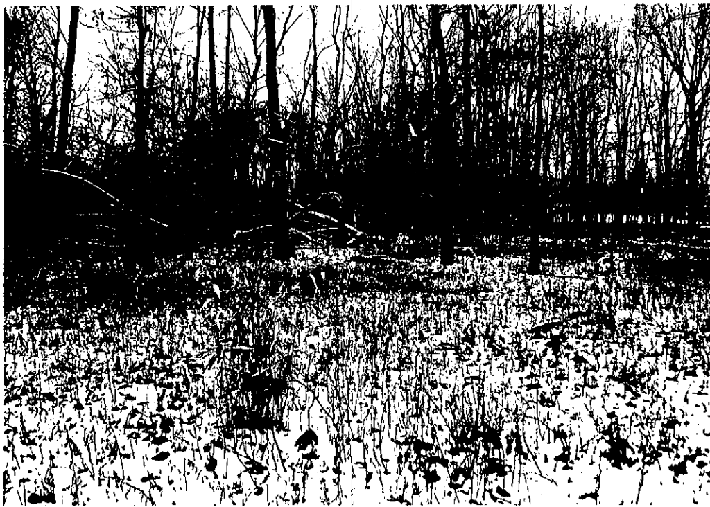
Photo 4. Cane plant at Shellbark Bottoms Natural Heritage Landmark. Date of photo: January 3, 2003.