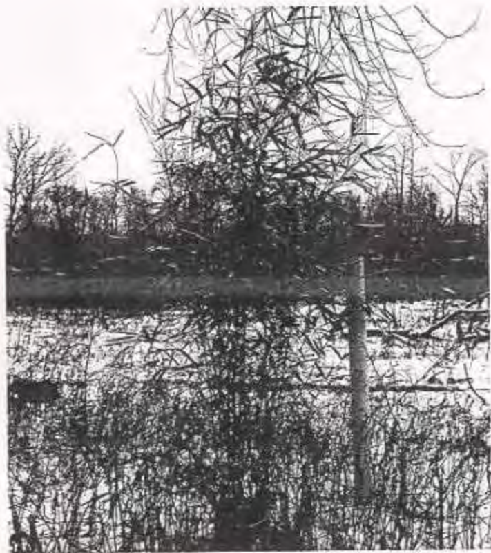
Photo 5. Cane plant with lateral shoots at Shellbark Bottoms Natural Heritage Landmark, Lawrence County, Illinois. Date of photo: January 3, 2003.