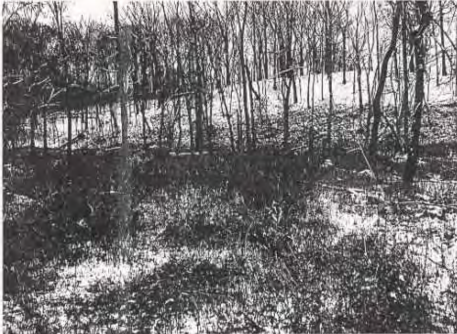
Photo 1. Photo of cane cluster at Shellbark Bottoms Natural Heritage Landmark, Lawrence County, Illinois. Date of photo: January 3, 2003.