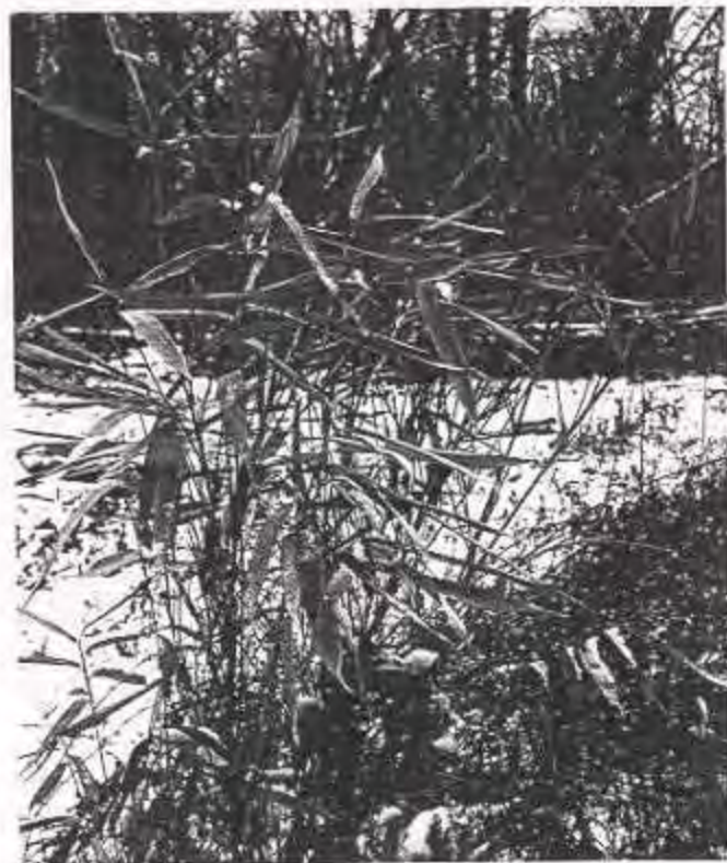
Photo 6. Cane plant at Shellbark Bottoms Natural Heritage Landmark, Lawrence County, Illinois. Date of photo: January 3, 2003.