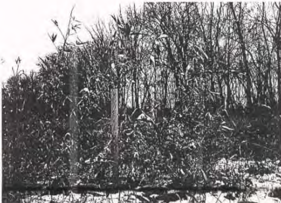
Photo 2. Photo of cane plants at Shellbark Bottoms Natural Heritage Landmark, Lawrence County, Illinois. Date of photo: January 3, 2003.