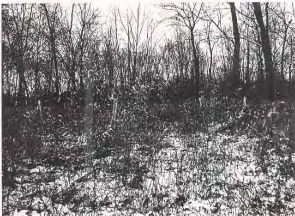
Photo 3. Cane plants at Shellbark Bottoms Natural Heritage Landmark. Date of photo: January 3, 2003