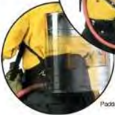
Padded Lumbar Support