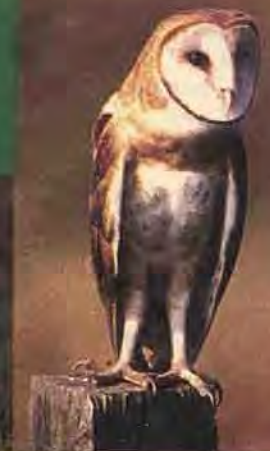
Upland Sandpiper Grasshopper Sparrow Short-eared Owl Greater Prairie Chicken Barn Owl