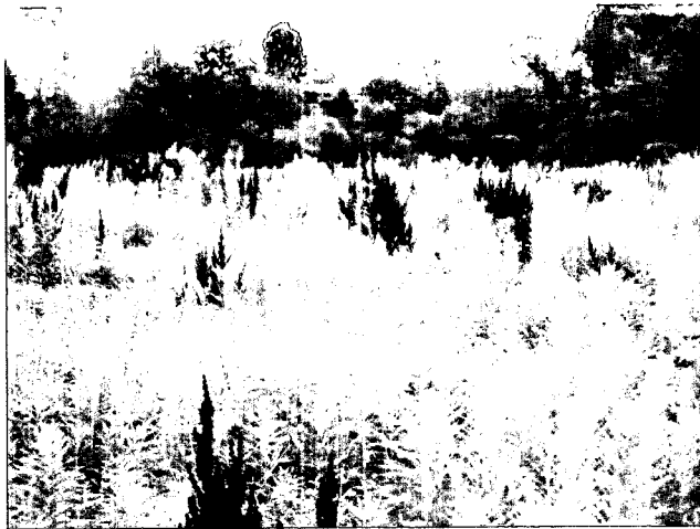
Looking east into prairie