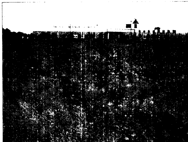
Looking north across prairie toward school