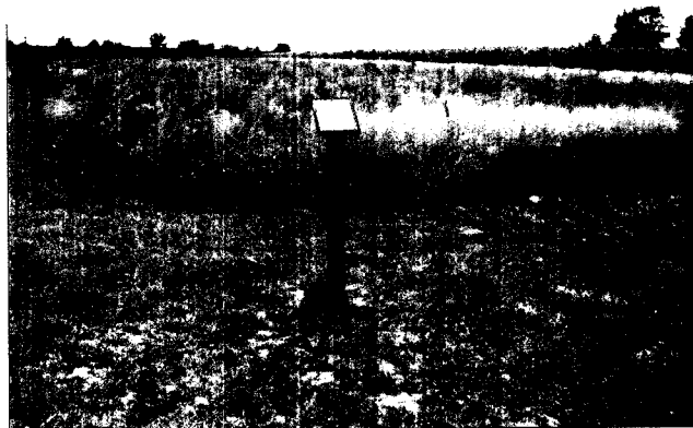
Looking south at first trail sign