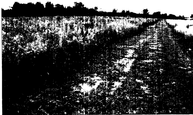
Looking south along west trail