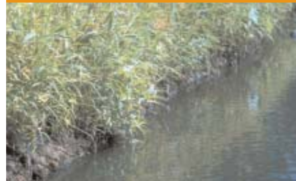
Flint Creek, Barrington