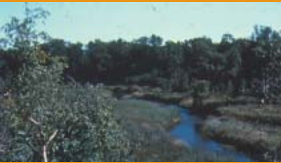
Nippersink Creek storm corridor protection