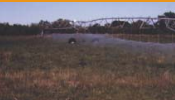
"The Fields" wastewater irrigation