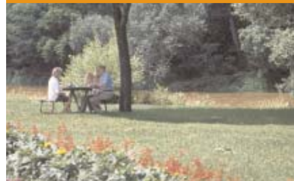
Beautified natural settings