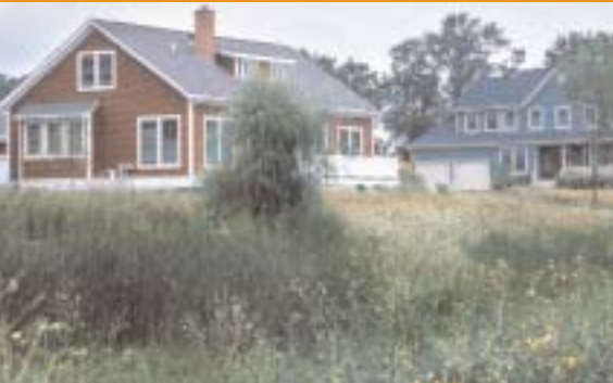
Prairie Crossing, Grayslake