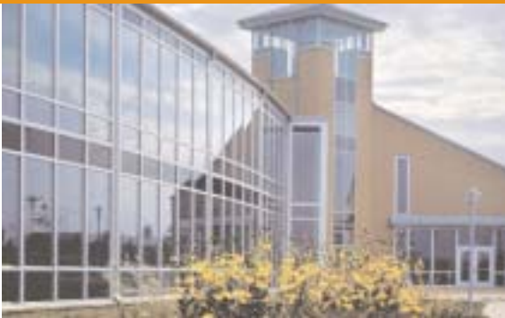
Matteson Village Hall