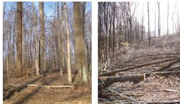
A BUYER TAKE ALL CUT

2. Owner Logging: Greater returns can be realized if you have the time, know-how, labor, and equipment to carry out the logging operation economically.