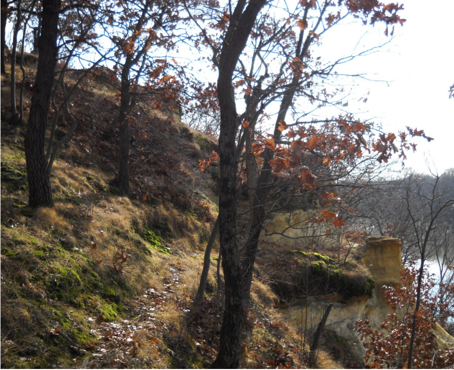
A place ash never grew...a Rock River Bluff near Oregon.