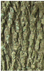
Diamond Shaped Bark