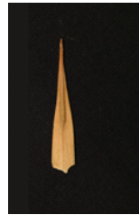
Ash Tree Seed