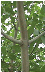
Opposite Leaf Arrangement