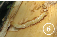
bell shaped sections