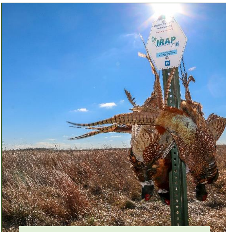
A successful upland game hunt in Whiteside County

give IRAP a try. In addition, IRAP provided landowners with a habitat management plan and funded up to seventy-five percent cost-share to implement habitat management practices in the plan. This was an attractive incentive to landowners, and within the first couple of years, IRAP had over 10,000 acres leased for hunting and fishing.