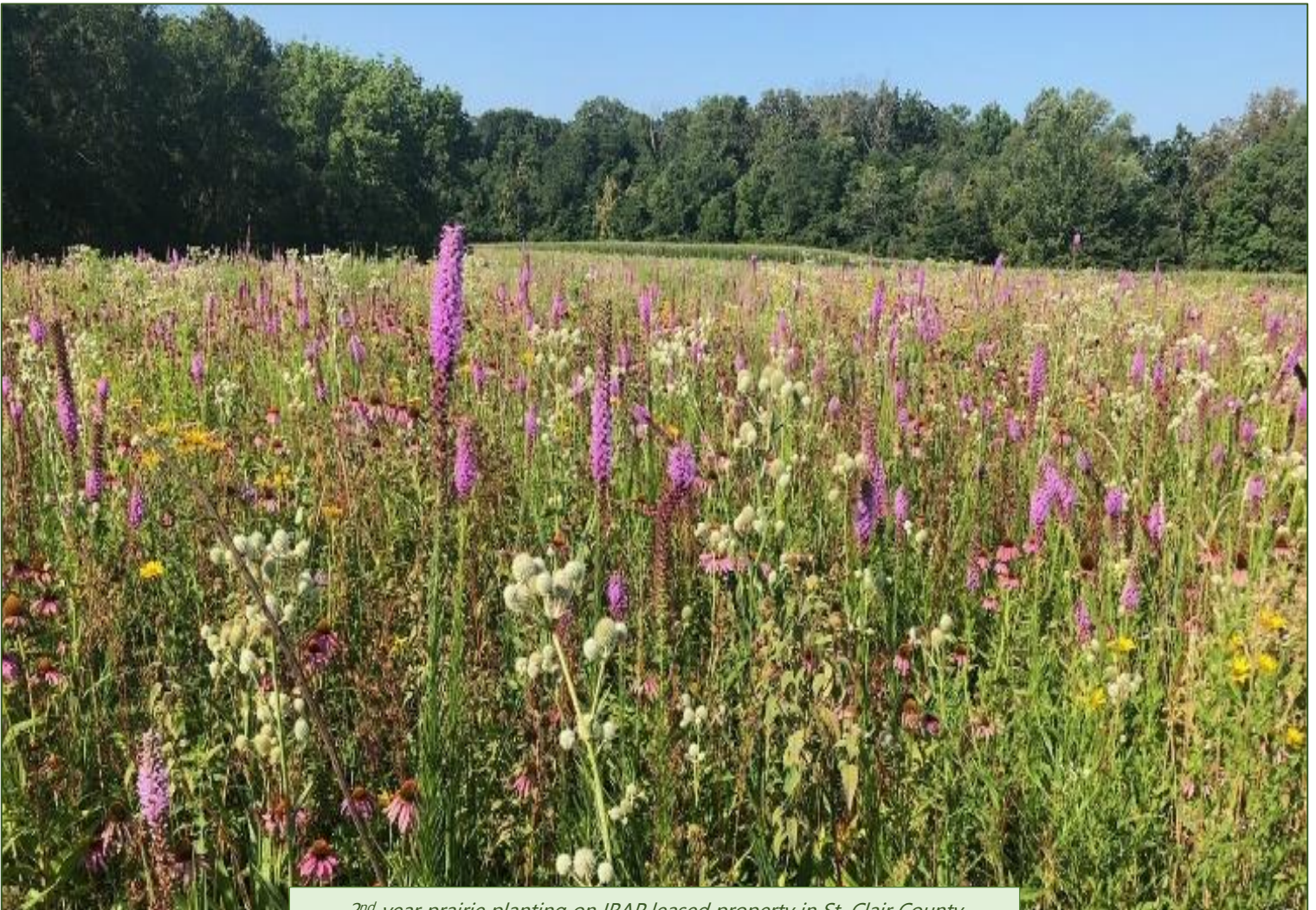
2 nd year prairie planting on IRAP leased property in St. Clair County

Habitat management has been a big part of the IRAP's success. In 2014, IRAP partnered with Pheasants Forever, Quail Forever and the National Great Rivers Research and Education Center to create two habitat strike teams to work on IRAP leased private land. The habitat strike teams assist private landowners with a variety of management practices, including prescribed burning, tree planting, timber stand improvements and much more. IRAP has seen more game animals and birds on acres previously unmanaged, and hunters comment on how "nice" the properties are and the abundance of wildlife they see. In addition to assisting landowners with implementing conservation projects, IRAP has been able to educate landowners about various habitat practices so they can continue with the management. Within the last six years, IRAP has implemented numerous habitat projects on more than 16,000 acres of leased private land.