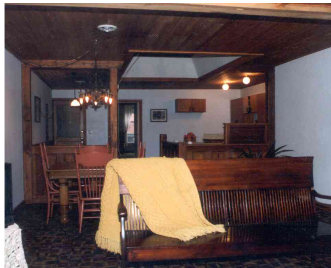
Living room and kitchen before rehabilitation