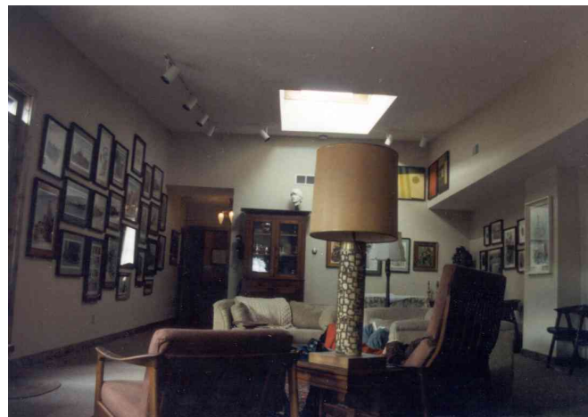
Owners' living room after rehabilitation