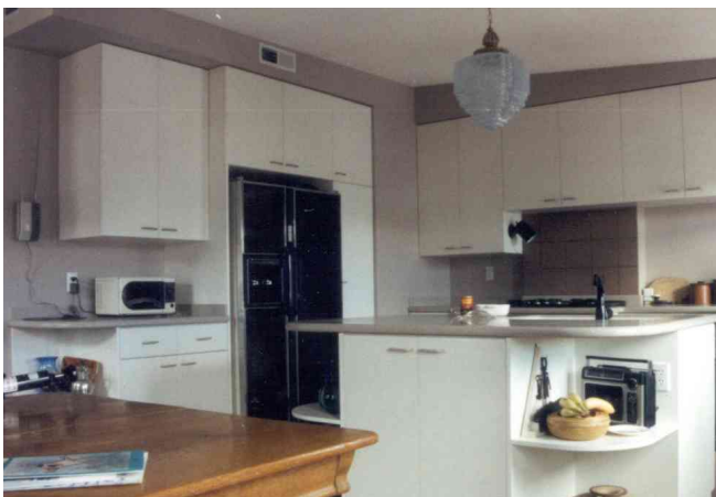
Owners' kitchen after rehabilitation