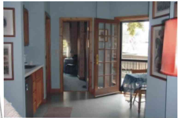
Guest suite kitchen after rehabilitation