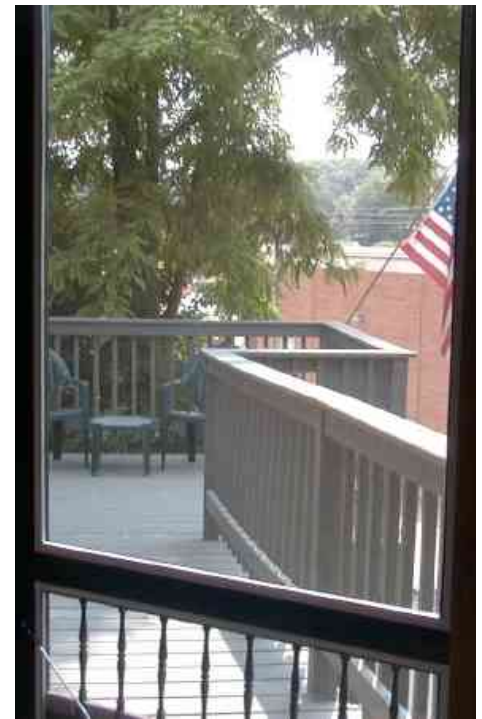
New deck off of guest suite