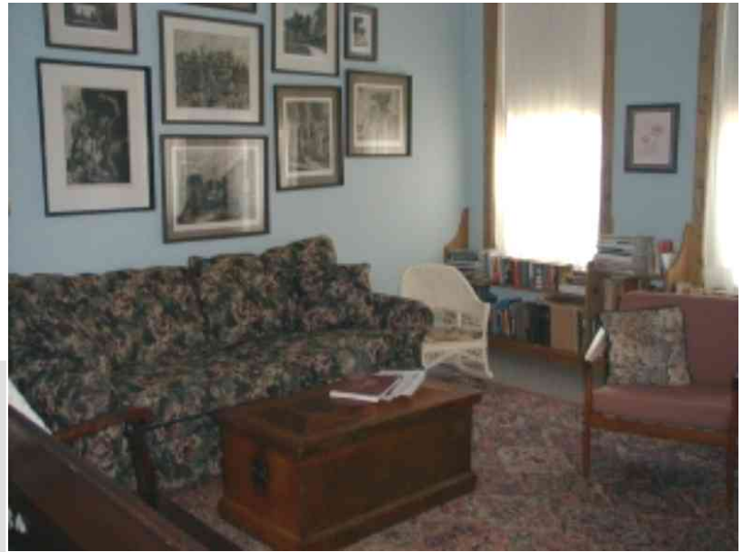
New living room in guest suite