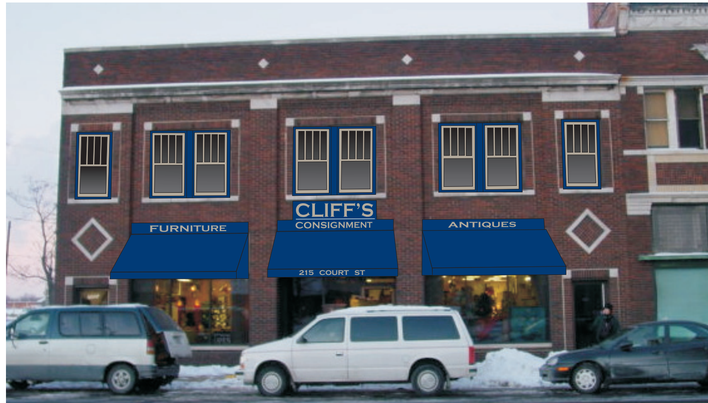
PROPOSED SCHEME 1