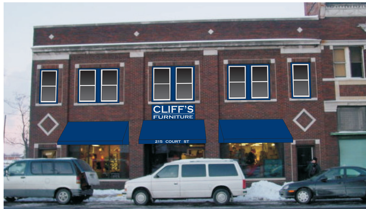
PROPOSED SCHEME 2