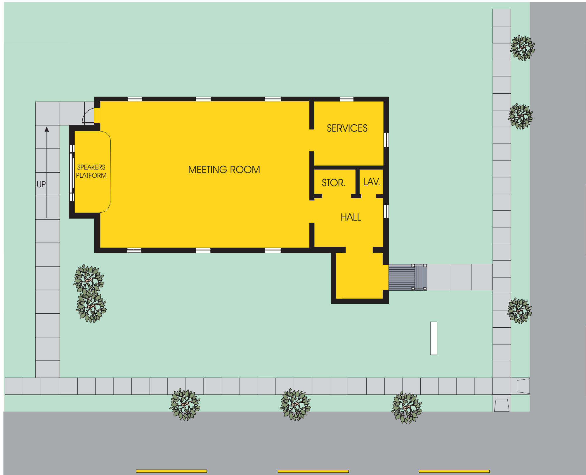
PROPOSED DESIGN SCHEME 2

NOTE: The Illinois MAIN STREET Program, through the Illinois Historic Preservation Agency, has provided this free design assistance to qualified property/business owners in the officially designated MAIN STREET project areas. The rendering on this sheet is a conceptual view of the facade renovation based on information supplied to the staff architects. Should obscured architectural details or problems be revealed during the work, the local project manager and/or the staff architects should be consulted.