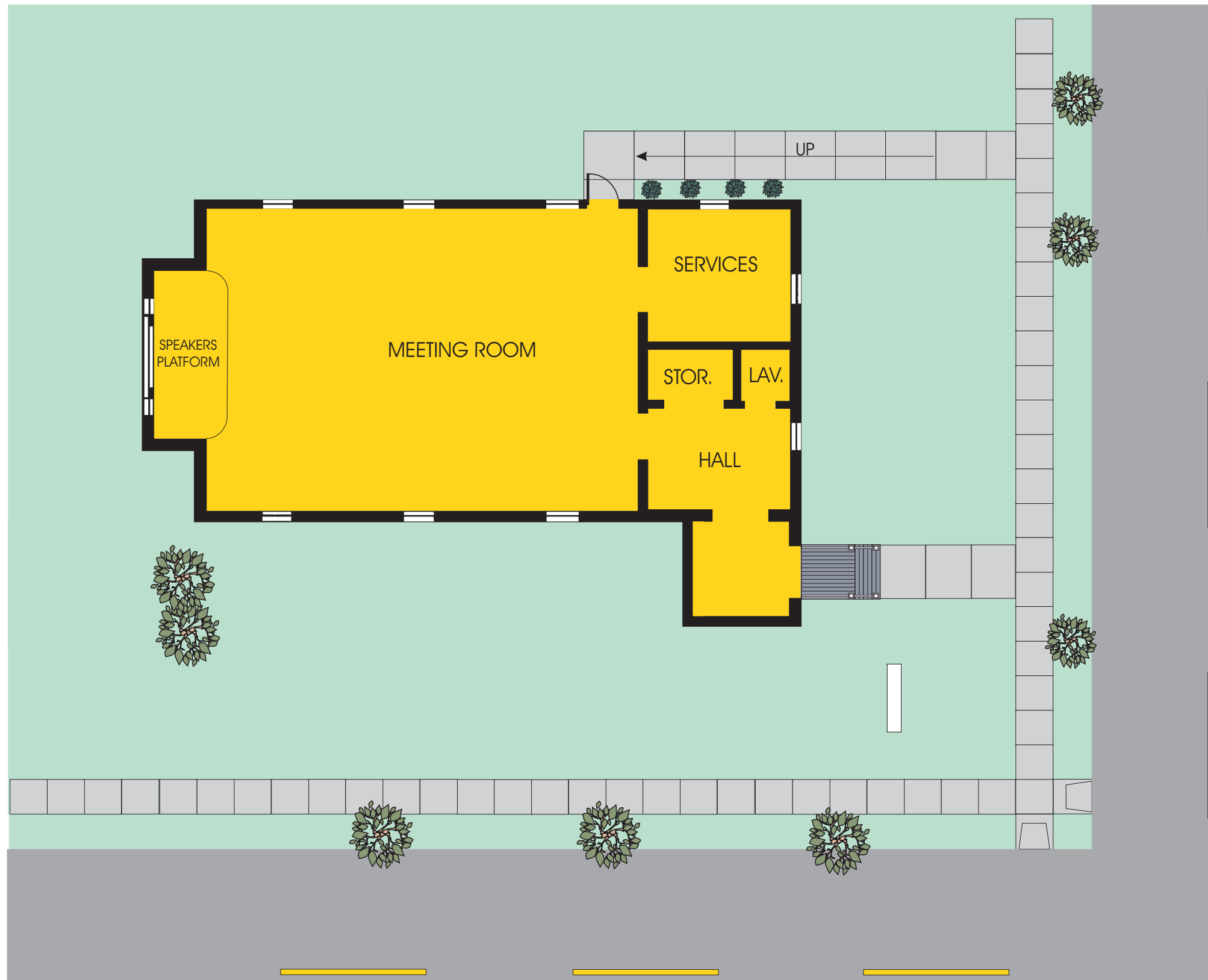
PROPOSED DESIGN SCHEME 1

NOTE: The Illinois MAIN STREET Program, through the Illinois Historic Preservation Agency, has provided this free design assistance to qualified property/business owners in the officially designated MAIN STREET project areas. The rendering on this sheet is a conceptual view of the facade renovation based on information supplied to the staff architects. Should obscured architectural details or problems be revealed during the work, the local project manager and/or the staff architects should be consulted.