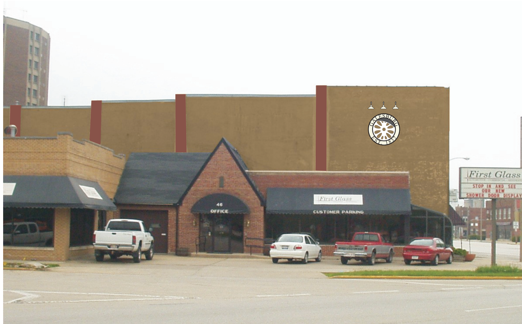
PROPOSED PAINT SCHEME 2