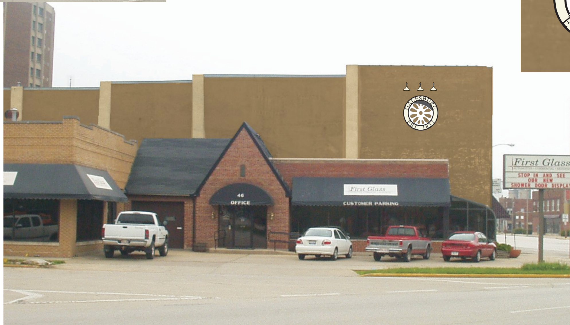
PROPOSED PAINT SCHEME 1

NOTE: The Illinois Historic Preservation Agency, has provided this free design assistance to qualified property/business owners in the officially designated project areas. The rendering on this sheet is a conceptual view of the facade renovation based on information supplied to the staff architects. Should obscured architectural details or problems be revealed during the work, the local project manager and/or the staff architects should be consulted.