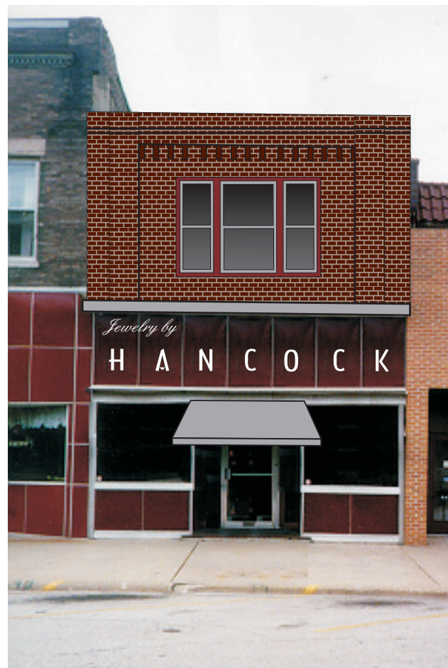
PROPOSED DESIGN WITH AWNING