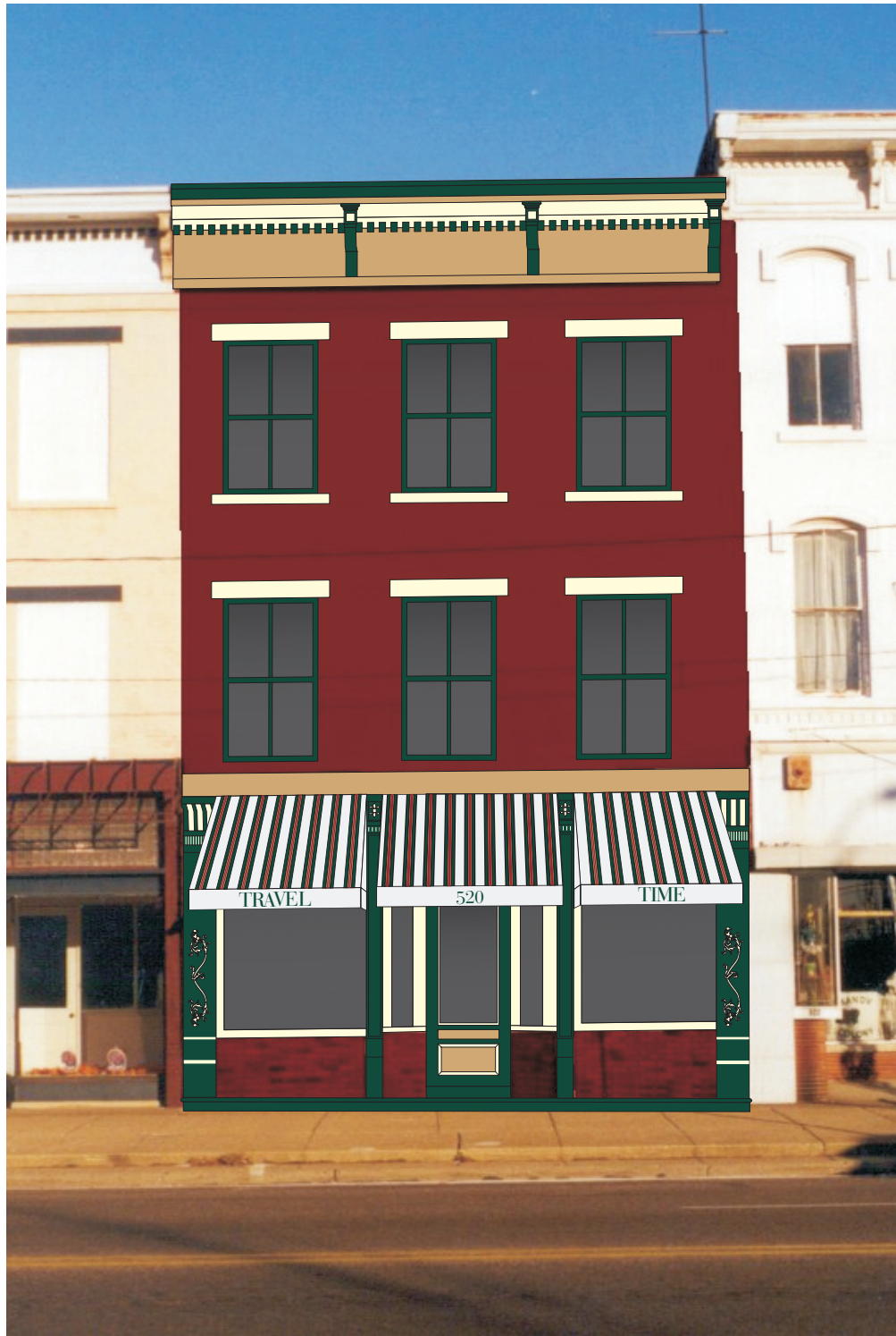
PROPOSED DESIGN WITH AWNINGS