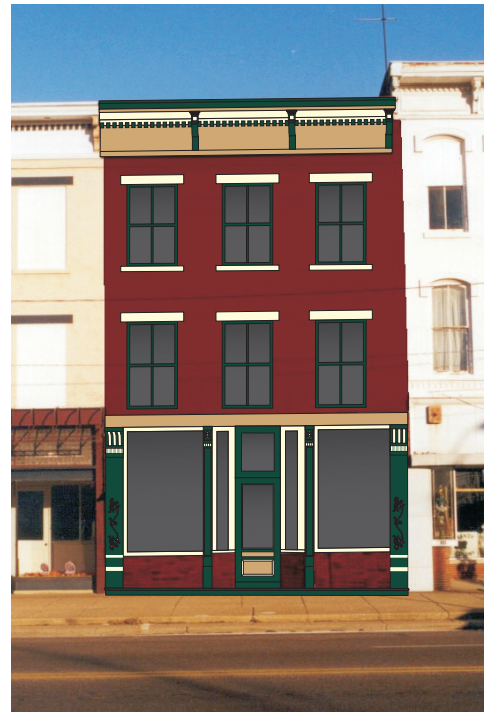
PROPOSED DESIGN WITHOUT AWNINGS