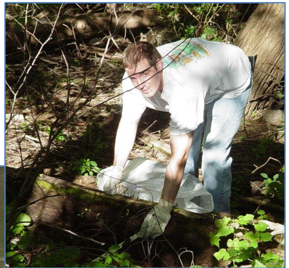
Photo - Keep Rock Island Beautiful - 2009

A total of 39 applications were received for the 2010 SCALE program. Thirty-seven applications were approved for funding for a total cost of $41,250. Nonpoint Source Unit staff provided assistance to the two applicants that did not qualify for the 2010 SCALE program.