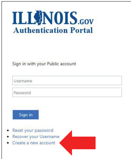
Figure 1: Sign Up for an Illinois Public Account