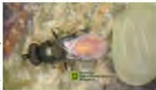
Oobius agrili -Solitary, egg parasitoid. Photo shows female laying egg in EAB egg

and in THIS corner Oobius : EAB's NEMESIS!!