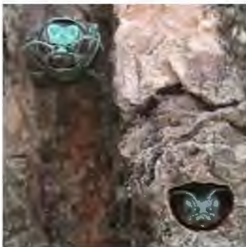
EAB adults emerging from an ash tree after their destructive life cycle

In that corner, emerald ash borer (EAB), the metallic green beetle wreaking havoc on ash trees across North America -