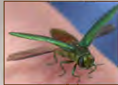
↑ Emerald Ash Borer—Deadly to Ash Trees

The Emerald Ash Borer, however, may nibble on ash leaves, but it is most destructive during its larval stage when boring into the trunks and limbs of ash trees as it matures and ultimately cutting off the nutrient supply to the tree and thereby causing the tree to die.