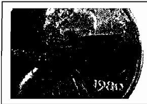
Emerald Ash Borer