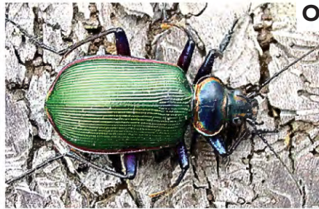
University of Arkansas