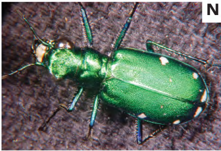
Michigan State University

The following insects are common to Michigan and could possibly be confused with emerald ash borer.