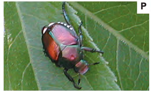
Michigan State University