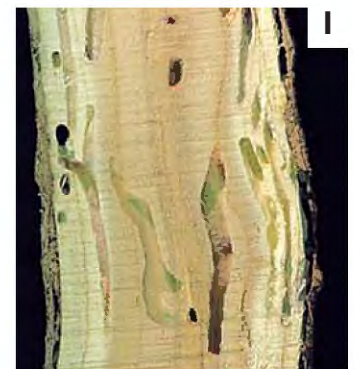
Csoka, Hungary For Res Inst., www.forestryimages.com