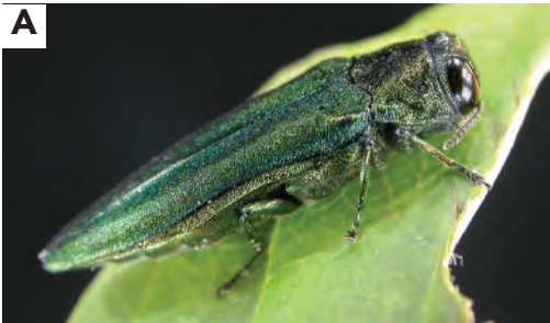
Michigan State University