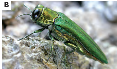
Michigan State University