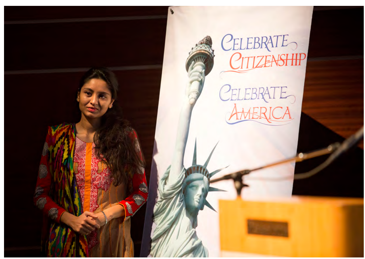
College of DuPage Newsroom. (August 28, 2015). "Celebrate Citizenship, Celebrate America" Naturalization Ceremony at College of DuPage 2015 62 [photograph]. Flickr. <u>https://www.flickr.com</u>

The mission of the Office of Hispanic and Latino Affairs (OHLA), housed within the Illinois Department of Human Services is to eliminate barriers in the delivery of human service programs and services to Limited-English-Proficient