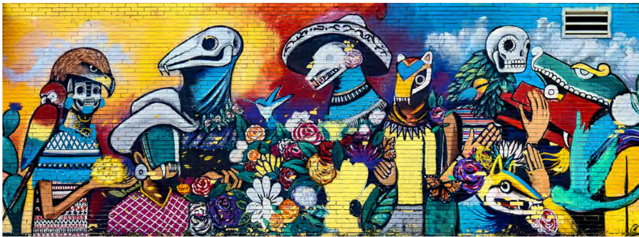
Faircloth, T. October 29, 2019. "Calavera Creatures: Mural by @mr.pintamuro seen at 26th and Central Park in the Little Village Area of Chicago, IL." Online image. December 29, 2022. Flickr.com

In addition to the programs listed above designed specifically to meet the needs of refugees and immigrants, Illinois also developed legislation and special initiatives to address unmet needs of undocumented immigrants, including the following.